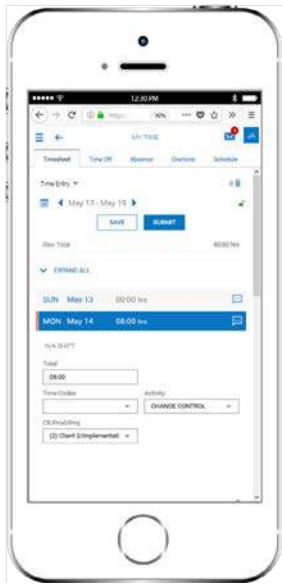
FIGURE 3: The field employees at a major retail consulting firm were able to capture their activities whether they were in the field, in the office, or at home on the couch.

In an age when the power of technology is making our lives easier, salaried employees quickly become frustrated with outdated, clunky systems. By embracing the architecture of consumer-style solutions, enabling access across mobile devices, and integrating with other commonly used productivity tools, organizations can better ensure white-collar adoption of time and activity tracking solutions.